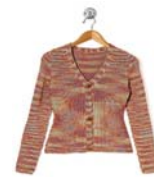
cotton twist colours

From one of our most popular basic yarn suppliers, Sirdar , sirdar.co.uk, for those of you who love to knit with a light weight acrylic blend, we have been stocking Country Style DK in many colours, and a new put-up, 100g balls. Their new Zanzibar is a fabulous furry glitzy concoction in awesome colours with great pattern support. We also brought in some more of the Snuggly dk and snowflake dk , and we have new colours coming in the snuggly dk and tiny tots dk with loads of new patterns. A new yarn for 07 will be a printed cotton blend ribbon called "Surfer" with some great patterns. Wait till you see their new luxury line designs, " Sublime ". They are!