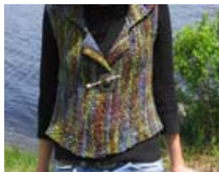
Fleece Artist Maid Marion Vest

From fleeceartist.com , & handmaiden , the wonderful handpainted natural fibre yarns from Nova Scotia, we will bring in a 2/12 Suri alpaca/bluefaced Leicester blend they are introducing after Christmas.